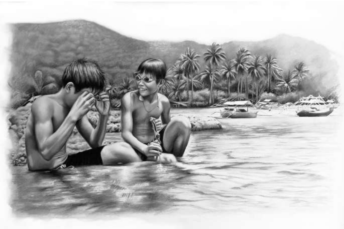
Mga katutubong bata na nagsisibat pangingsda sa Dibut dagat – dagatan. Probinsya ng Aurora Indigenous children spearfishing at Dibut Bay. Aurora Province

Dalagang T'nalak nasa bintana ng bahay kubo. Lake Sebu, Probinsya ng South Cotabato T'nalak girl in a nipa hut window. Lake Sebu, South Cotabato Province