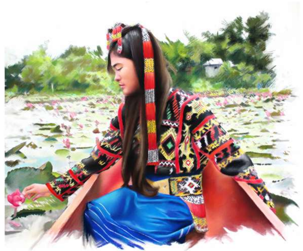
Dalagang T'boli sa Lake Sebu. Probinsya ng South Cotabato T'boli girl in Lake Sebu. South Cotabato Province