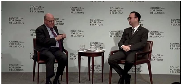
US-Philippines Society Director Ambassador Frank Wisner and Secretary Alan Peter S. Cayetano, Council on Foreign Relations, New York City, 2 October 2017.