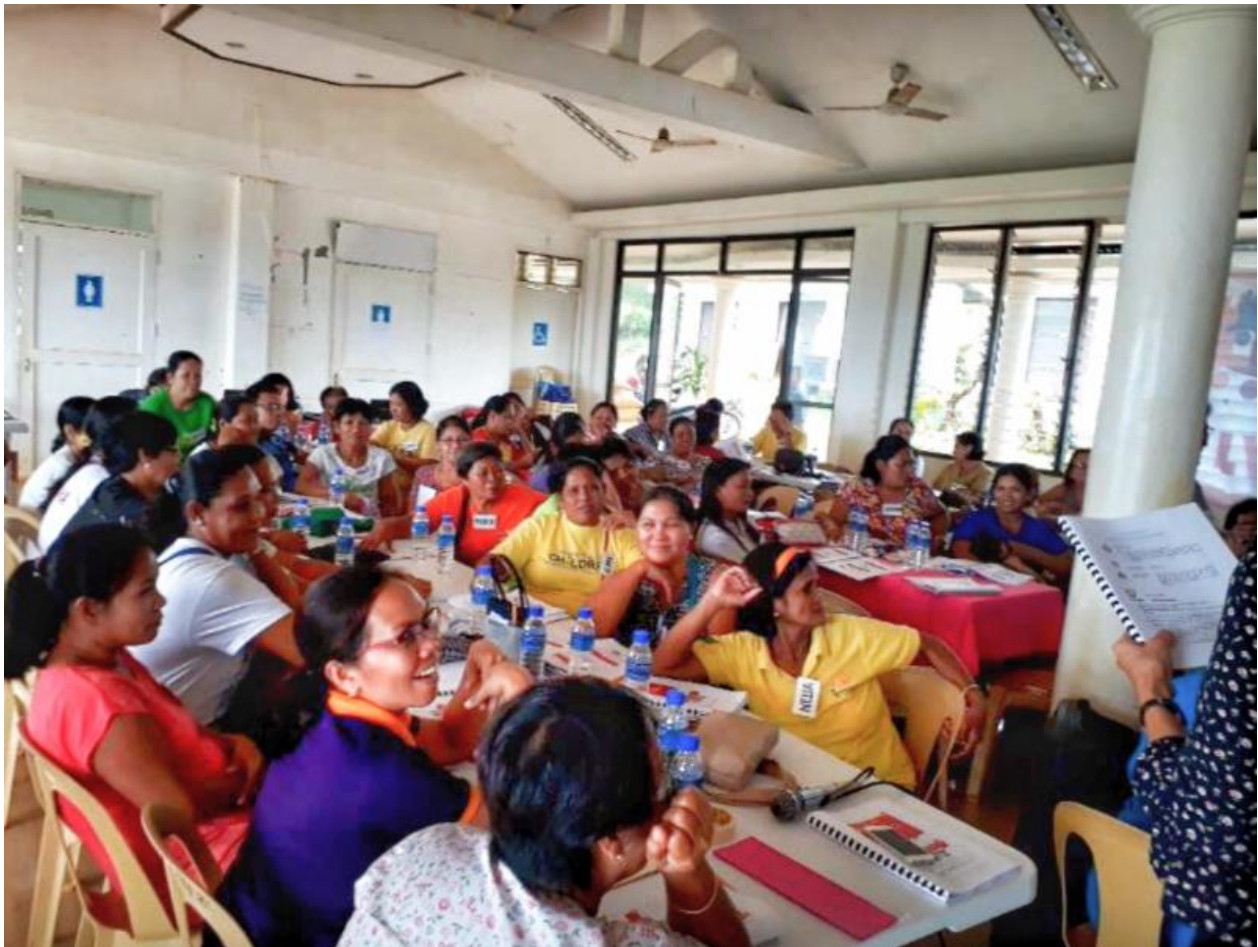
Facilitator lectures parents on effective listening and communication with emphasis on addressing the physical, emotional, psychological and social needs of adolescents.