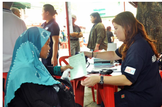
Volunteer Medical Staff monitors vital signs of an evacuee.