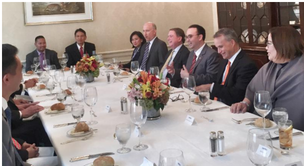
US-Philippines Society Directors met Secretary Alan P. Cayetano on 27 September, Washington D.C.

In New York City, Society Director Ambassador Frank Wisner chaired an October 2 conversation with Secretary Cayetano at the Council on Foreign Relations focusing on President Duterte's independent foreign policy, Philippines-US relations, governance and human rights, conflict in Mindanao, regional security, and the Philippines' role as chair of ASEAN 2017. Read more.