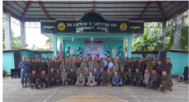
Members of the Pacific Angel 2017 at the closing ceremony in Cebu, Philippines, 3 July 2017. PACANGEL is a multilateral humanitarian assistance program between U.S. and civil and military partners in the Pacific providing medical health outreach and supporting civil engineering projects.