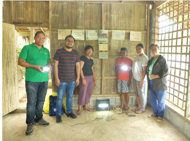
Pang-itan Dye Facility is located on a side of a mountain with no connection to the grid, and its only natural light source is a small window facing north.