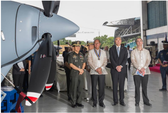
U.S. Military Presents 2 New ISR Aircraft to the Philippine Air Force, 27 July, 2017. Attending the ceremony are (l-r) Defense Secretary Delfin Lorenzana, U.S. Ambassador Sung Kim and PH Foreign Affairs Secretary Alan P. Cayetano.