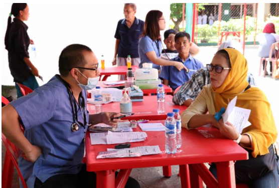
The Triage Unit evaluates evacuees' medical condition.

A grant from the US-Philippines Society, personal donations, contributions by the Philippine Nurses Association of America and the Philippine Humanitarian Coalition supported the work of a mobile medical team of 60 volunteers led by Makati Medical Center physicians, in partnership with the Philippine Disaster Resilience Foundation (PDRF). Over 1,200 evacuees including pregnant women, mothers and young children were seen and treated on August 2-4 in Iligan City. Read more