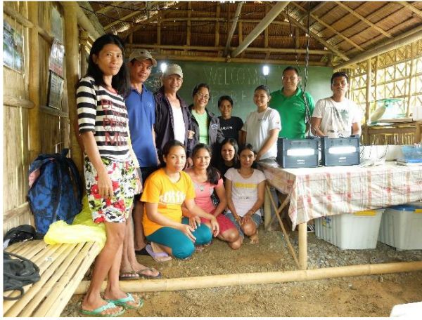
SAMANA Training Facility, Aklan. Located near mountains and a river, with ideal conditions for growing plants used for dyes and abaca, the site has one center that is accessible only by foot or motorbike and has no electricity.

The program assisted remote communities engaged in traditional hand weaving, knotting, embroidery and dyeing of fabrics, primarily using piña and abaca fibers derived from indigenous plants in the Philippines. Using the battery charger included in solar lighting kits, members are able to charge mobile devices, a critical tool for weather forecasts in remote localities. The use of solar lighting has improved productivity and income, safety, and disaster preparedness.