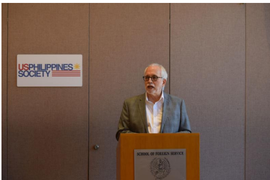
Peter Eisner, Author of MacArthur's Spies

The US-Philippines Society conducted fundraising efforts to support the Filipino Veterans Recognition and Education Project (FilvetREP) that was organized following the passage of the Filipino Veterans of World War II Act in 2016. The project aims to raise public awareness of sacrifices by Filipino veterans who fought alongside American soldiers during WWII. An October 25 U.S. Congressional Gold Medal ceremony will formally recognize the WWII Filipino veterans. Read more