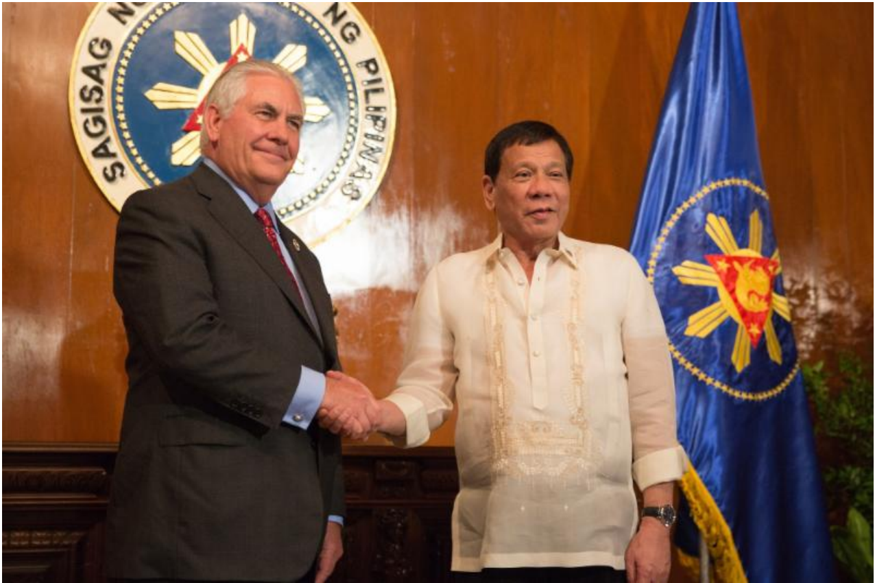
President Rodrigo Duterte welcomed U. S. Secretary of State Rex Tillerson. Discussion focused on issues including denuclearization of the Korean Peninsula, maritime security, counterterrorism, U.S.-Philippines economic relations and people-to-people ties, 8 August, 2017, Malacañan Palace, Manila.

As 2017 ASEAN Chair, President Duterte has advanced priority initiatives to promote peace and stability in the region and enhance maritime security in the waters around ASEAN through coordinated patrols. The initiative also aims to spur inclusive and innovation-led growth and economic integration to reduce barriers to the free flow of goods. Duterte engaged ASEAN leaders and strategic dialogue partners in a series of productive meetings.